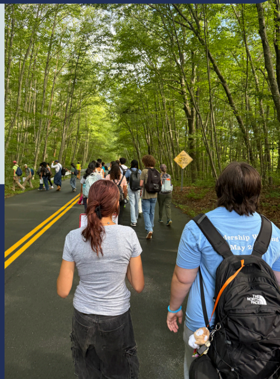
Teens before a forestry walk (credit: Shanelle Thevarajah)