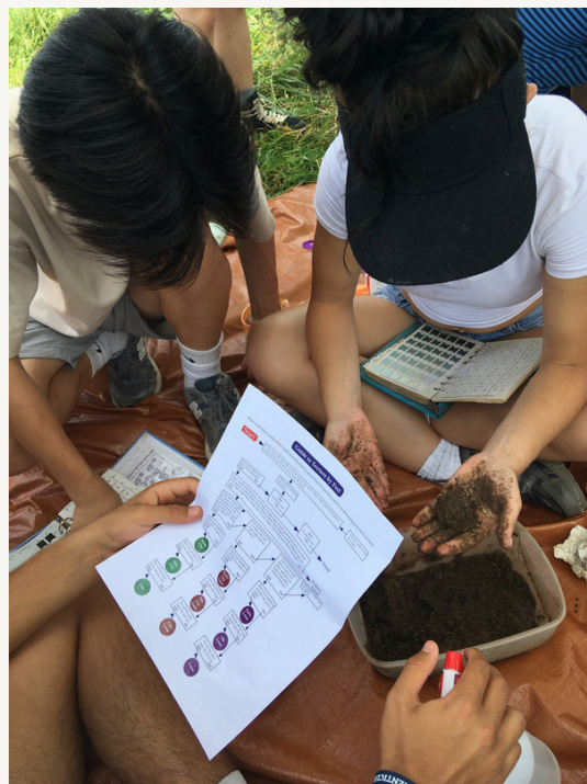
Hands on soil science!