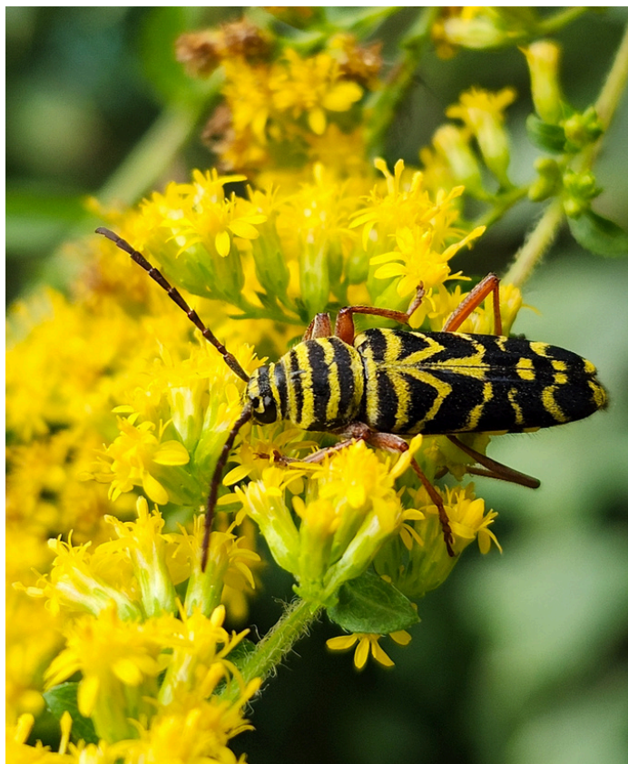
Locust Borer in the Sun

Along with this meaningful progress, we acknowledge that gaps still exist. Connecticut's climate education mandate is unfunded, meaning that it does not allow for school systems, many of which are chronically underfunded, the time or resources to create high quality instruction around the most pressing topic of our time. Another ongoing problem is the lack of access to outdoor spaces within the K-12 education sphere. Conservation advocacy arises from values around stewardship and care cultivated in our youngest learners. Without direct access to nature now, how can we expect future voters to prioritize its protection later?