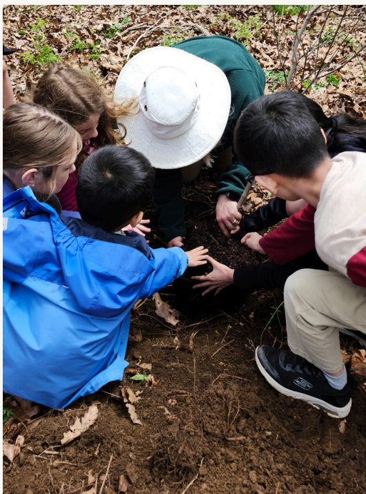
Tree Planting for Arbor Day

We serve our members by supporting professional development, providing networking opportunities, and promoting environmental education in Connecticut.