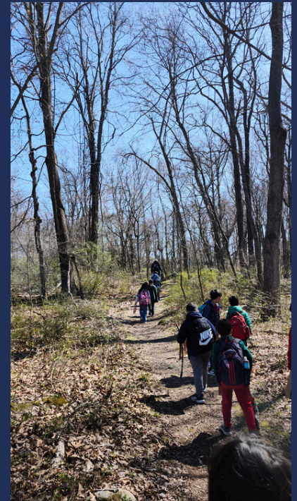
Onwards We Go (credit: Evelyn Kubik)