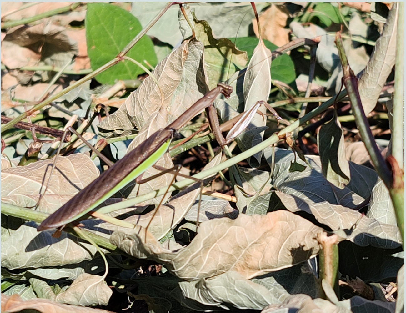
Praying mantis